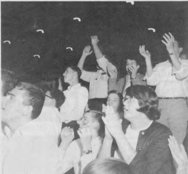
Spirit and enthusiasm radiate from the faces of spectators and cheer-block members at the Clay - Adams basketball game.

The play Our Miss Brooks and the Christmas Carol was presented December 8 and 9 to the first hour language classes and the first hour study halls. A small fee of only 20 cents per person was charged.