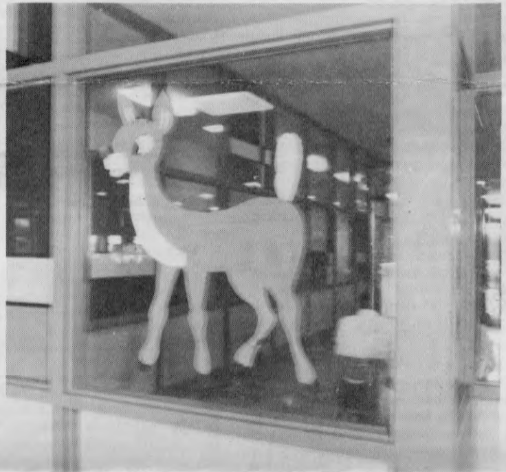
Rudolph the Red - Nosed Reindeer was one of the many paintings created by Clay's Art Club to decorate the halls for the Christmas season.