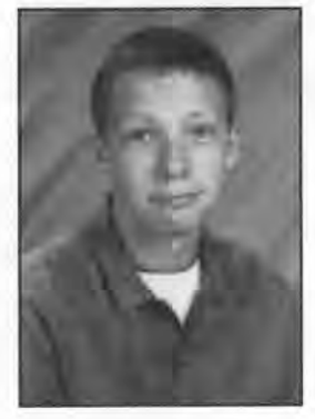
"The Pajama Game. I had a lot of fun!"