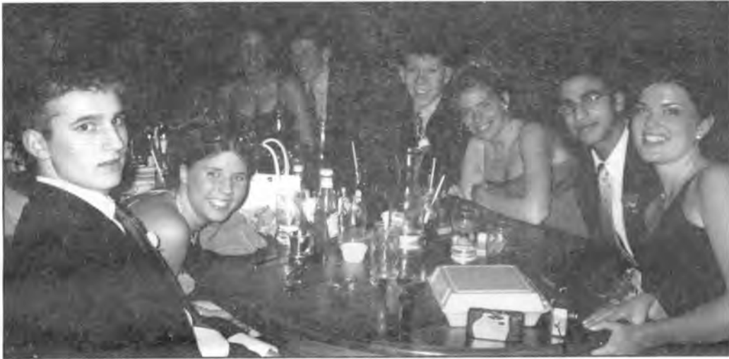
A group of Clay students grab some enjoy some fine dining before heading to Mid-Winter.