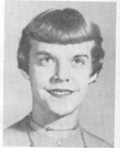
COLONIAL EDITOR CHOSEN FOR '55-'56

Throughout the audience was scattered many out-of-town visitors. The day after the play this reporter was informed that a profit of $85.00 was taken in.