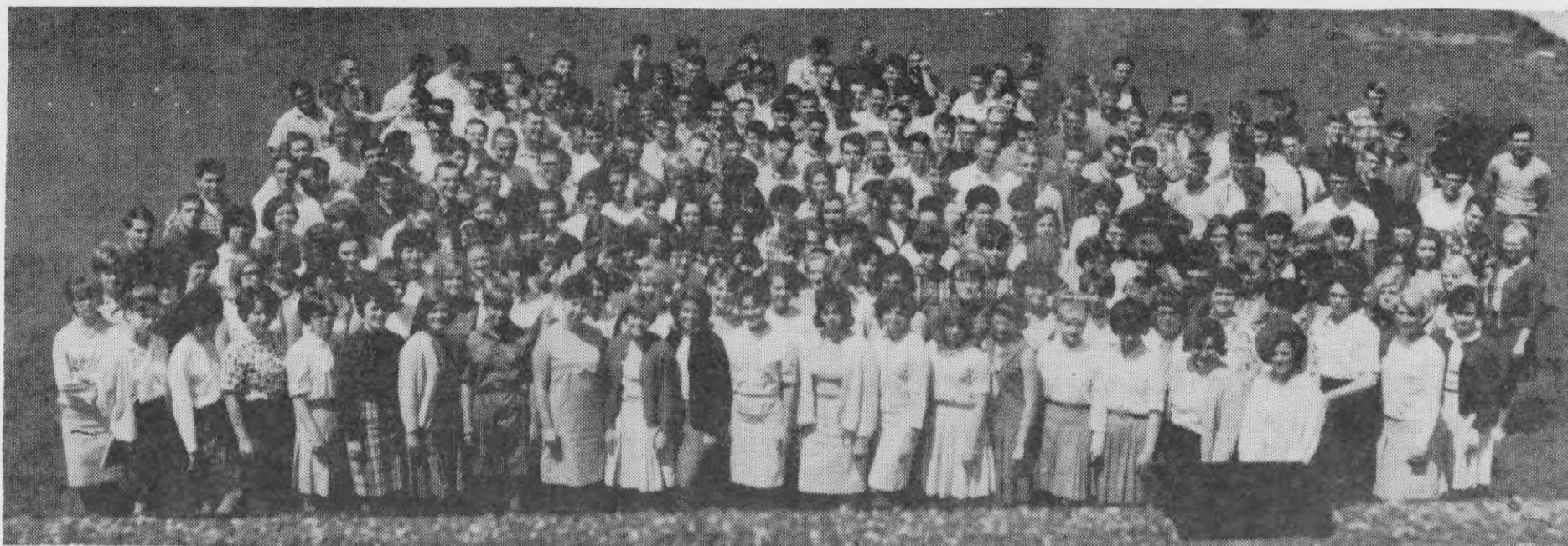
Two - hundred and sixty - one seniors eagerly await graduation.