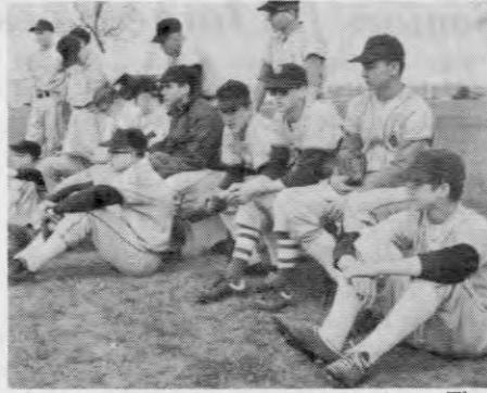
B-team awaits last, victory inning. They came from behind to win 4-3.