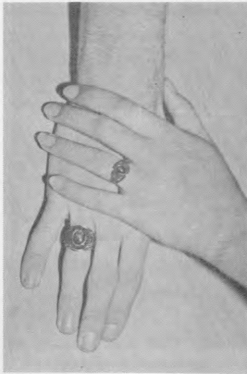
For the first time in Clay's history a standard School Ring has been adopted. As shown in the picture they are dome topped instead of the traditional square topped class rings.

The A.F.S. just concluded a potluck given so that Foreign students from other schools in our area could get acquainted with each other and each others country.