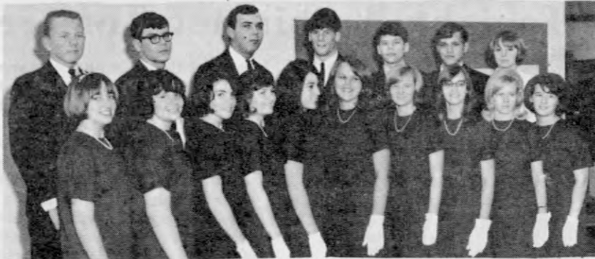
After being in "business" one year, the Swing Choir has added male voices. Their next scheduled performance will be a Pop Concert in March.