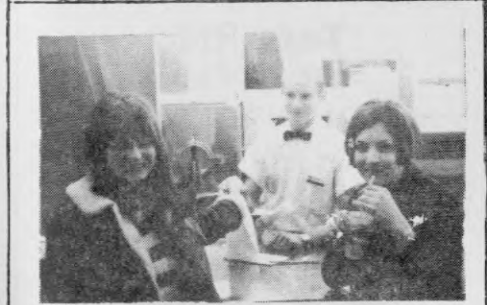
PEOPLE ON THE GO AT CLAY GO BURGER CHEF