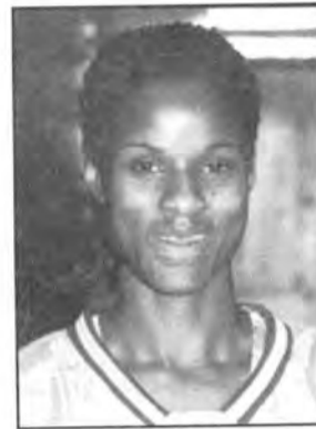
Senior Altarea Hall